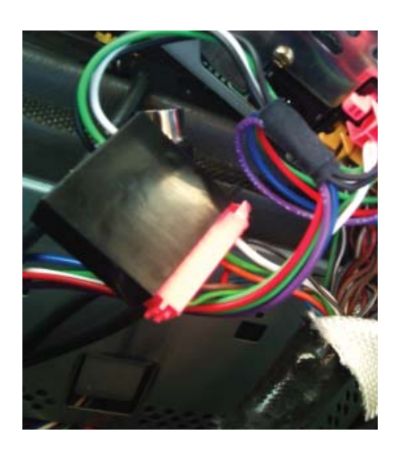
Step 9: Now the device needs to be energized, this is done through the brakeout adapter for the 12 volt outlet included in the kit. By putting adaptor between the cigarette lighter socket and its connectors.