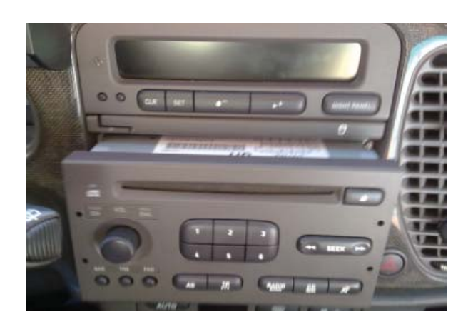
Step 3: Gently pull out the stereo, be careful so that nothing breaks.